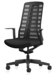
Swivel chair, mesh-covered backrest