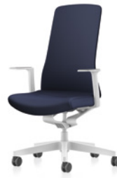
Swivel chair, upholstered backrest

PURE IS3 fits perfectly into any environment. Its clean-cut design and the large choice of colours and materials leave you free to customise your chair. The collection offers four swivel chair models: a mesh or upholstered backrest in either white or black. A variety of materials and colours are available to choose from. The Smart Spring, chair column and optional armrests are available in either all-white or all-black for all models. Choose between fixed T-armrests or 3D T-armrests; the fixed T-armrest impresses with its slim design, while the 3D T-armrest is exceptionally functional and height-, width- and depth-adjustable.