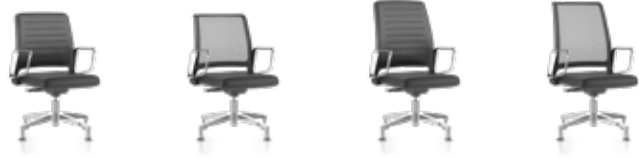
Conference chair low, upholstered seat and backrest Conference chair low, upholstered seat, mesh-covered backrest Conference chair high, upholstered seat and backrest Conference chair high, upholstered seat, mesh-covered backrest